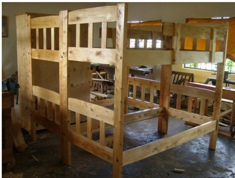
beds for the Makobe Project for disabled children